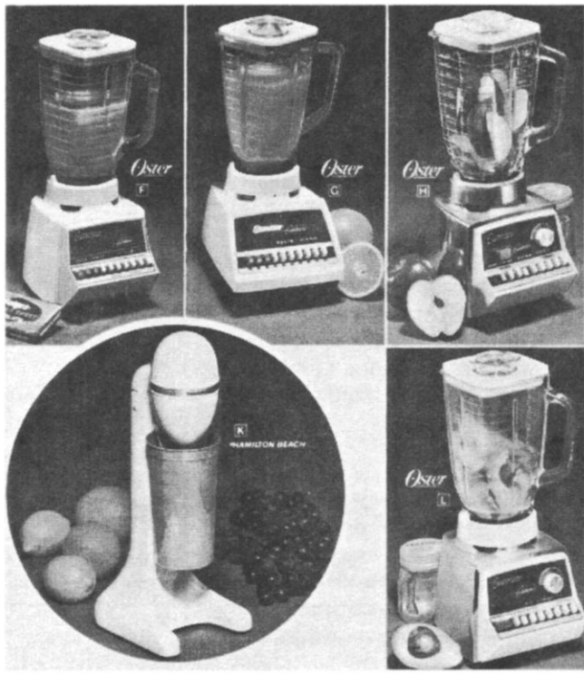
Figure 2 BRANDED VARIANTS IN BLENDERS

Clearly, heterogeneous consumer tastes is an important reason for offering product variation.